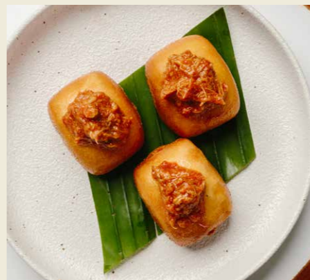
Chili Crab Bun 辣椒蟹饅頭