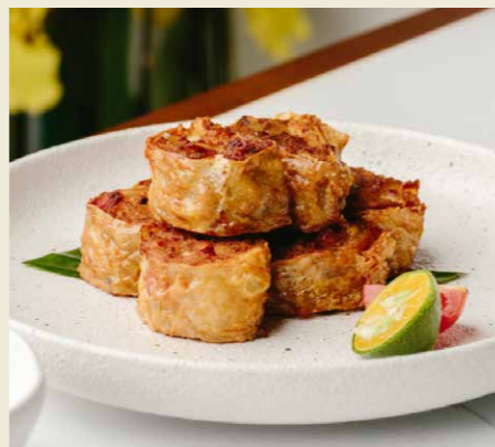
Prawn Roll 蝦糰