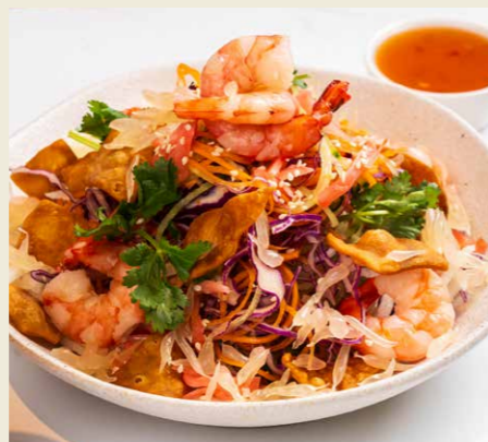
Special House Salad 鮮蝦沙律