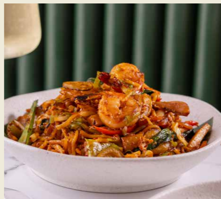
Mee Goreng 炒麵