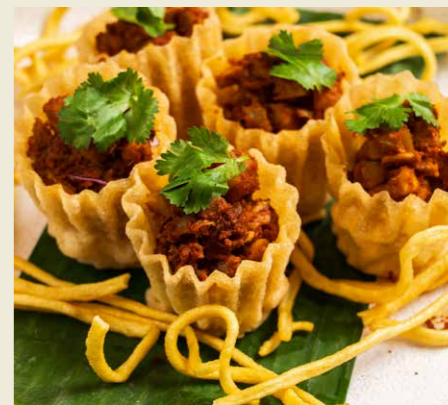
Curry Chicken Pie Tee 咖哩雞小金杯