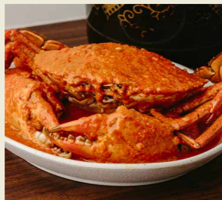
Chili Crab 辣椒蟹