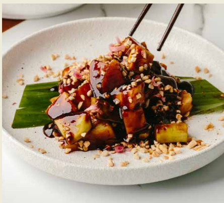
Rojak (v) 囉雜醬蔬果沙律