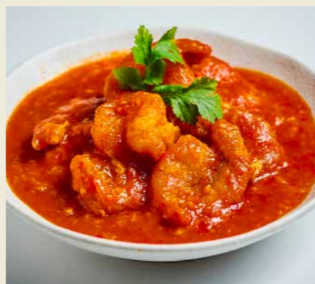
Chili Tiger Prawn 辣椒大虎蝦