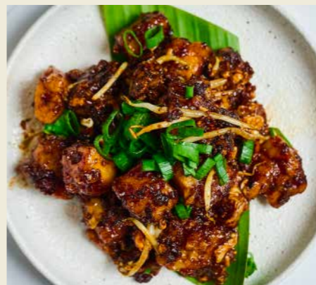
Turnip Cake 蘿蔔糕