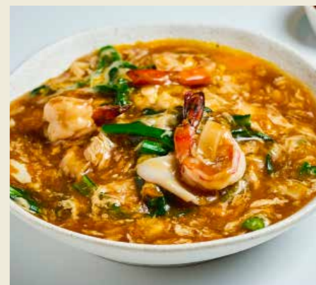
Seafood Wat Tan Hor 滑蛋河