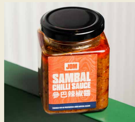
Retail Sambal 參巴醬