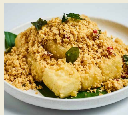
Cereal Tofu 麥皮豆腐