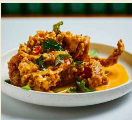
Salted Egg Soft Shell Crab 鹹蛋軟殼蟹