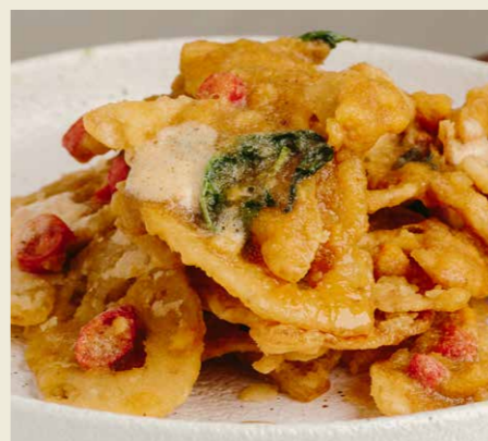
Salted Egg Lotus Roots 咸蛋炒酥炸蓮藕片