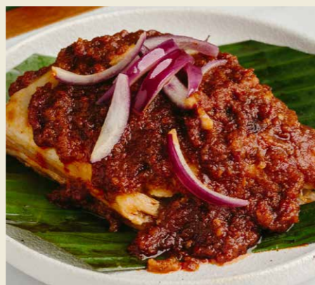
Sambal Stingray 烤魔鬼魚