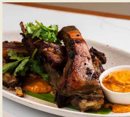
Lamb Short Ribs 香烤羊排