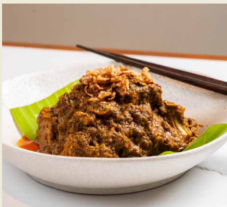
Jackfruit Rendang 菠蘿蜜仁當