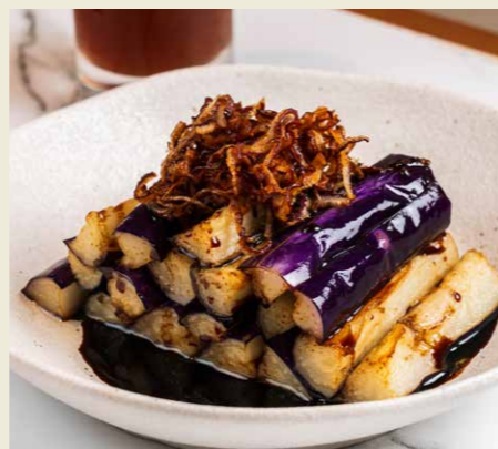
Teeing Asam Manis 甜酸茄子