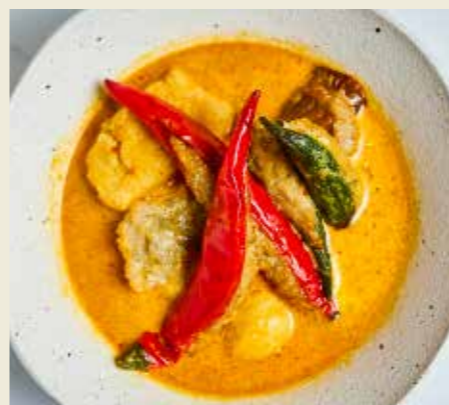
Laksa Yong Tofu 喇沙釀豆腐