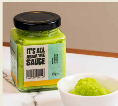
Bottled Kaya 咖央醬