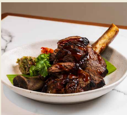
Grilled Beef Short Ribs 烤牛肋骨