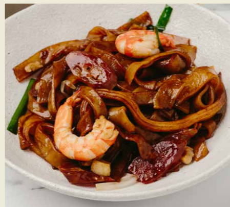
Char Kway Teow 炒貴刁