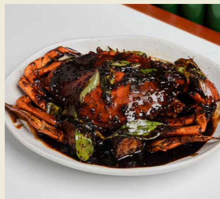
Pepper Crab 胡椒蟹