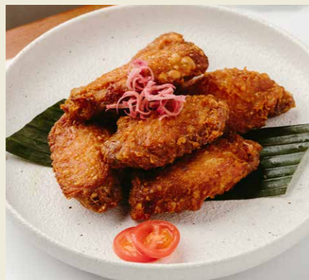
Prawn Paste Fried Chicken 蝦醬炸雞